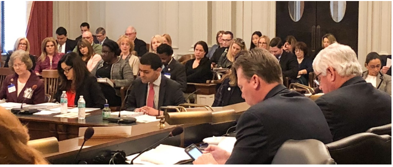
From left, Deputy Commissioner Deborah Hartel, Deputy Commissioner Marcela Maziarz, and Commissioner Shereef Elnahal are seen answering State Assembly Budget Committee members' questions on April 25.

We also addressed Governor Murphy's allocation of $100 million for a multi-agency, strategic, data-driven effort to combat the opioid epidemic through enhanced, community-based prevention